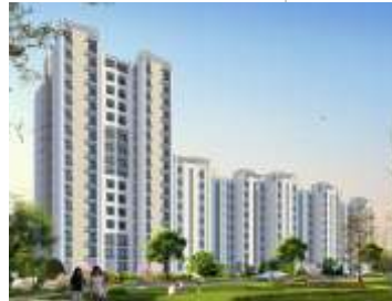
Tulip & Carnation, Mohali