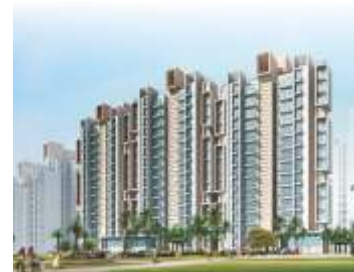
Green Escape, Sonipat