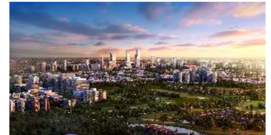
Sushant Megapolis, Greater Noida