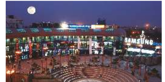
Ansal Plaza, New Delhi