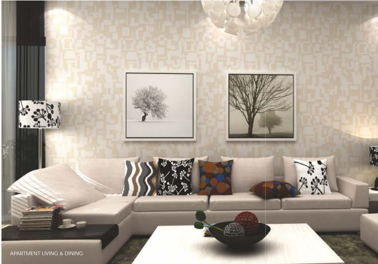
APARTMENT LIVING & DINING