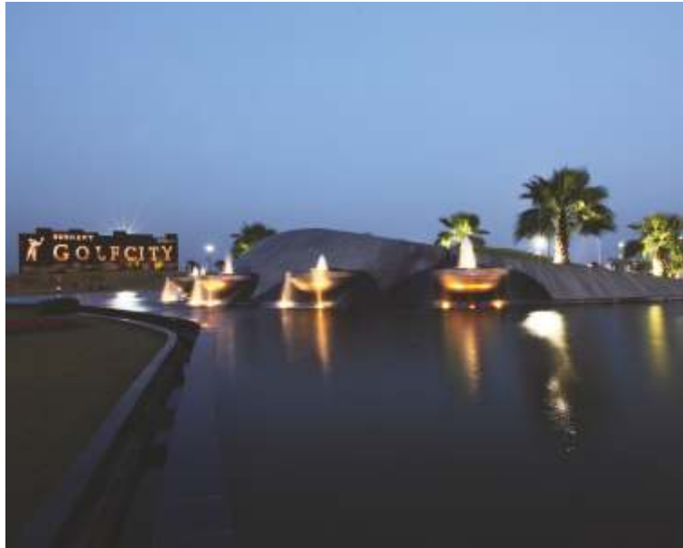
Sushant Golf City, Lucknow